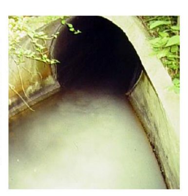
Figure 4-2. Examples of Levels of Clarity at Outfalls

• Floatables: Sewage, oil sheens, and suds are all examples of floatable indicators. Floatables that appear to be sewage are assigned a severity score of 3. Surface oil sheens are ranked based on their thickness and coverage. Note that natural sheens created by in-stream biological processes often form a sheet-like film that cracks if disturbed and are not indicators of illicit discharges. Suds are rated based on their foaminess and staying power. A severity score of 3 is designated for thick foam that travels many feet before breaking up. Suds that break up quickly may simply reflect water turbulence, and do not necessarily have an illicit origin. Suds that are accompanied by a strong organic or sewage-like odor may indicate a sanitary sewer leak or connection, whereas suds with a fragrant odor may indicate the presence of wash waters. Note that trash and debris are generally not considered illicit discharge concerns and should not be documented as floatables. Trash should be noted in Section 7 of the form. An example of floating solids is provided as Figure 4-3.