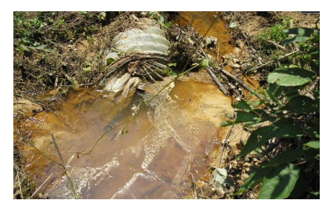
Figure 4-3. Floating Solids

• Floatables: Sewage, oil sheens, and suds are all examples of floatable indicators. Floatables that appear to be sewage are assigned a severity score of 3. Surface oil sheens are ranked based on their thickness and coverage. Note that natural sheens created by in-stream biological processes often form a sheet-like film that cracks if disturbed and are not indicators of illicit discharges. Suds are rated based on their foaminess and staying power. A severity score of 3 is designated for thick foam that travels many feet before breaking up. Suds that break up quickly may simply reflect water turbulence, and do not necessarily have an illicit origin. Suds that are accompanied by a strong organic or sewage-like odor may indicate a sanitary sewer leak or connection, whereas suds with a fragrant odor may indicate the presence of wash waters. Note that trash and debris are generally not considered illicit discharge concerns and should not be documented as floatables. Trash should be noted in Section 7 of the form. An example of floating solids is provided as Figure 4-3.