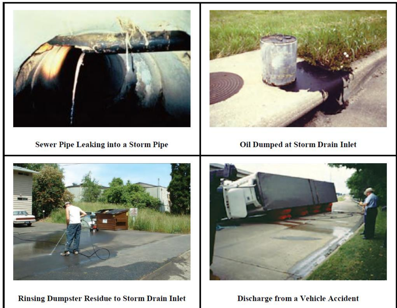
Figure 1. Examples of Illicit Discharges