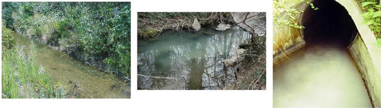
Figure 2. Examples of Levels of Clarity at Outfalls

Color and Clarity: Color and clarity are best evaluated by collecting the discharge in a clear bottle and holding it up to the light. Color is rated by the tint or intensity of the color observed and clarity is rated based on how easily light can penetrate through the collected sample. The severity scale is further defined on the inspection form.