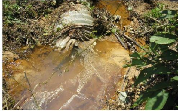
Figure 3. Floating Solids

**Photographs should be taken of all visible indicators.