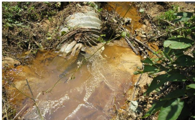
Figure 4-3. Floating Solids