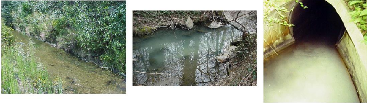
Figure 4-2. Examples of Levels of Clarity at Outfalls