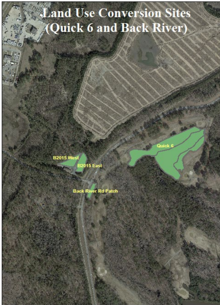
Figure 4: Quick Six Course and Back River Road Sites.

(5) Quick Six Course and Back River Road Sites (Figure 4). Collectively these sites comprise 4.22 acres. The B2015 West patch was planted in 2020 in wildflower mix, but was destroyed by deer and groundhogs. It will be replanted in spring 2022. B2015 East was planted in fall 2021 in a flowering clover mix to relieve browse pressure on the pollinator patch and because it is still used as a lay down area for equipment and disposing of wildlife carcasses. It will still flower during spring and summer with 4 varieties of perennial clover. Back River Road Patch was planted in 2020 and then over-seeded again in 2021 with pollinator mix and with laudatory comments from the chain of command and installation community. The patch labeled Quick 6 is slated to be planted in a quail and meadow mix pending invasive species removal and once much of the woody debris has broken down. Arthropod assessments will be considered beginning in 2022.