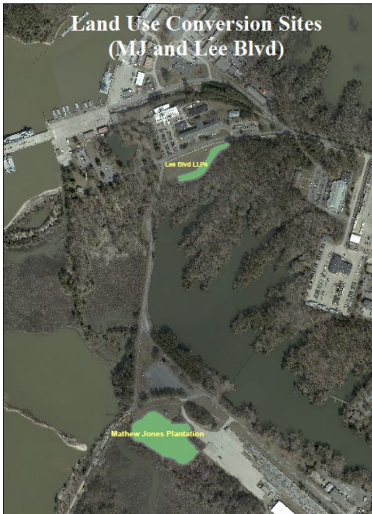
Figure 5: Mathew Jones House (MJH) and Lee Boulevard Site.

(6) Mathew Jones House (MJH) and Lee Boulevard Site (Figure 5). Mathew Jones House often referred to informally as the Matthew Jones House Plantation (4.4 acres) is a reforestation site created following the dismantling of the former wastewater treatment plant. Currently, thinning and invasive vegetation control is taking place. Trees were pruned or thinned to allow enough sunlight to grow ground vegetation and to assist in eradication of Johnson grass. Some arthropods were noted particularly a Cantheridae beetle larva foraging for prey on a red oak sapling and Polystepha pilulae gall (a dipteran midge) found on a red oak leaf. Planting of a portion of the site with native meadow/wildlife mix is anticipated in summer 2022. The Lee Boulevard site (1.05 acres) consists of longleaf pine planted several years ago and a pollinator mix was planted between the rows twice in 2021. Deer have eaten this plot to the ground, but several species of pollinators in this mix were not browsed on particularly Eutrochium and Asclepias . Replanting is anticipated with NWSG in summer 2023.