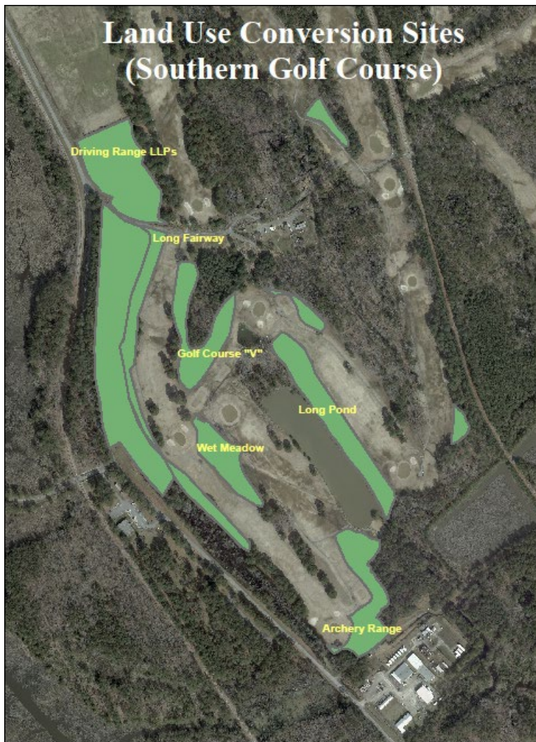
Figure 3: South Golf Course Site

(4) South Golf Course Site (Figure 3). These sites collectively comprise 17.45 acres. These sites were cleared of vegetation and woody competition in summer-winter of 2020 and planted in spring 2021. Results were mixed due to wet weather, planting depths, and potential golf course mowing. The Long Pond, and Golf Course V were planted in a pollinator and meadow mix and were mostly successful but will need to be augmented in the coming seasons. The Long Fairway (thin strip to the east) was planted in a roadside pollinator mix composed of mostly Rudbeckia and Coreopsis that did very well but is fairly short lived. The Archery Range was cleared of invasive species and woody competition in 2021 and will be planted in a upland bird/wildlife mix in spring 2022. Deer have eaten this patch to the ground because it was not large enough to withstand browsing. This site will be planted in a meadow mix and upland bird/wildlife mix in spring 2022. The 3 unlabeled patches on this map were largely unsuccessful and will likely be replanted in native grasses in 2023. Arthropod assessments will be considered beginning in 2022.