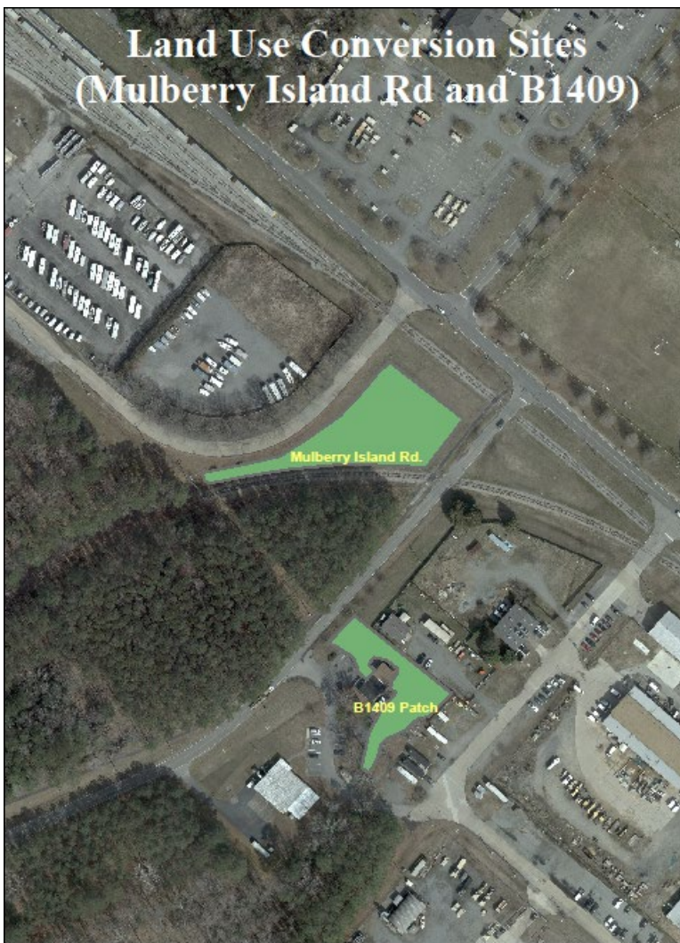
Figure 2: Mulberry Island Road/B1409 Sites

(3) Building 1409 Site (Figure 2). The general area surrounding building 1409 was also once a mowed area comprising 0.36 acres. Previous habitat work involved planting several wax myrtle shrubs were planted but the area was not maintained due to other work priorities. Since the area was replanted with the pollinator mix in 2020 adjacent to the parking lot and then expanded around the building in 2021. Additional plants including verbena were also planted. It is the most diverse site established thus far. A preliminary assessment of arthropod use was also made. The following arthropods were observed using the site: monarch butterflies ( Danaus plexippus ), various bumble bee species ( Bombus spp.), Megachile sp., Chauliognathus pensylvanicus , Polites themistocles , Eumernes fraternus , Popillia japonica , Lygaeus turcicus , Phoebis sennae , Apis mellifera , Plathemis lydia , Polistes metricus , Scolia bicincta , Sinea diadema , Eremnophila aureonotata , and Vanessa virginiensis .